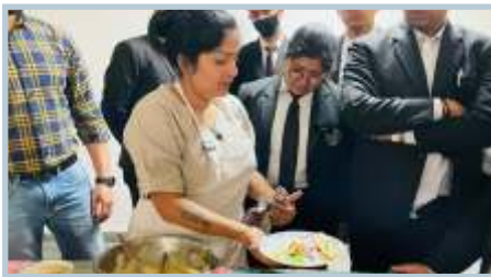
Interaction with Hotel Chef