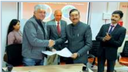
MOU for Placement