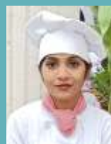
Sahiba Chef Hotel Vianta by Taj