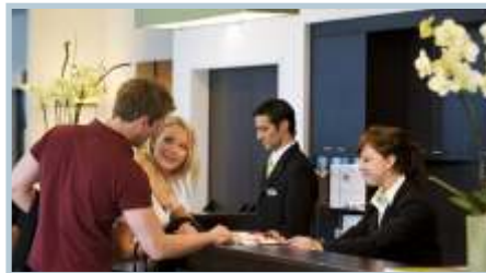
Life in Hotel