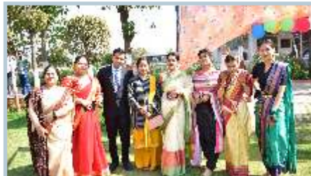
Students and Faculty in Campus