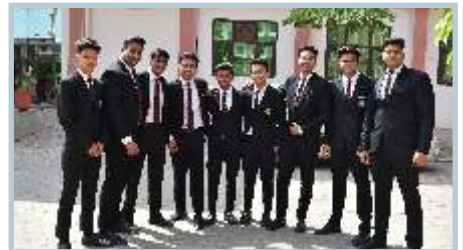
Life in College Campus